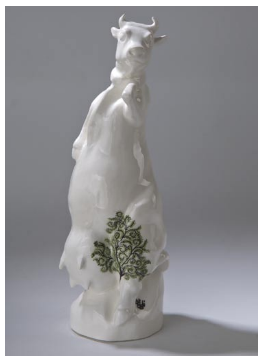
Title: COW-VID . Untitled Technique: Porcelain (Painted) H 38 cm