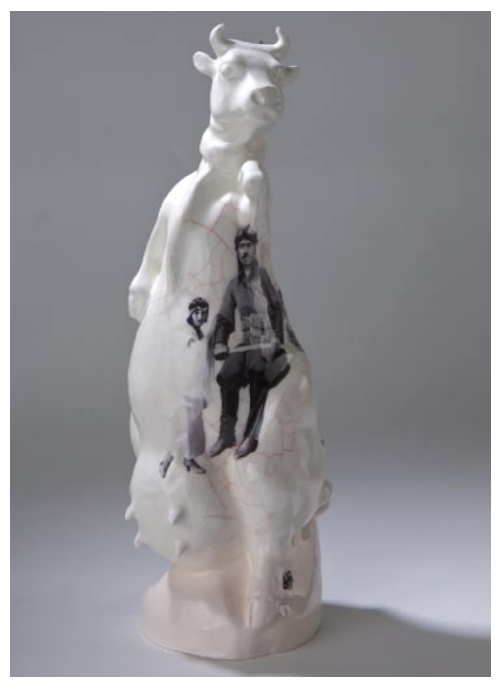
Title: COW-VID . Untitled Technique: Porcelain H 38 cm