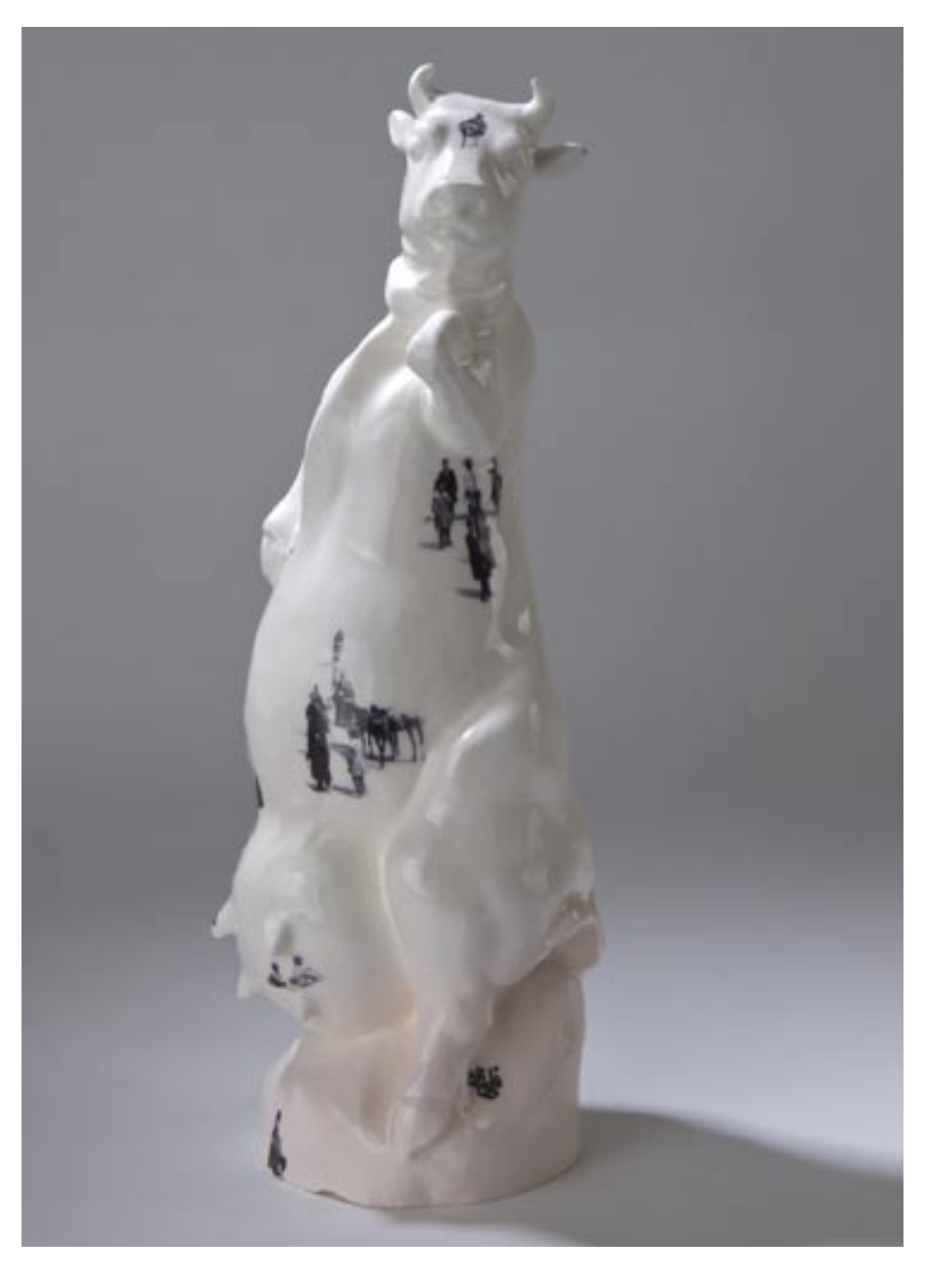
Title: COW-VID . Untitled Technique: Porcelain H 38 cm