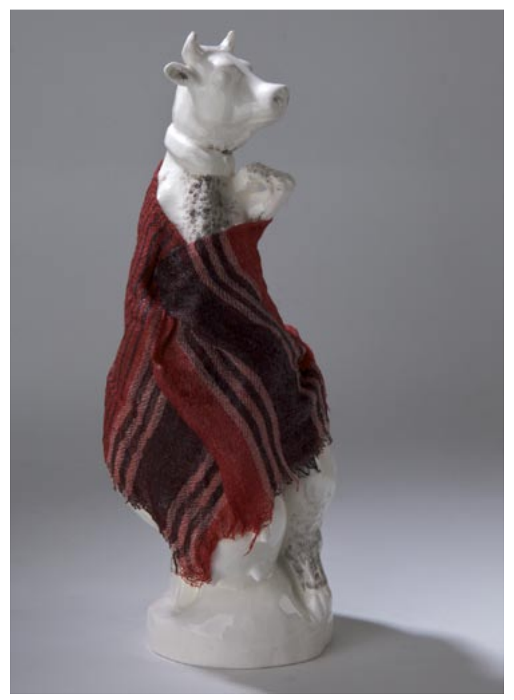
Title: COW-VID . Untitled Technique: Porcelain (+cloth) H 38 cm