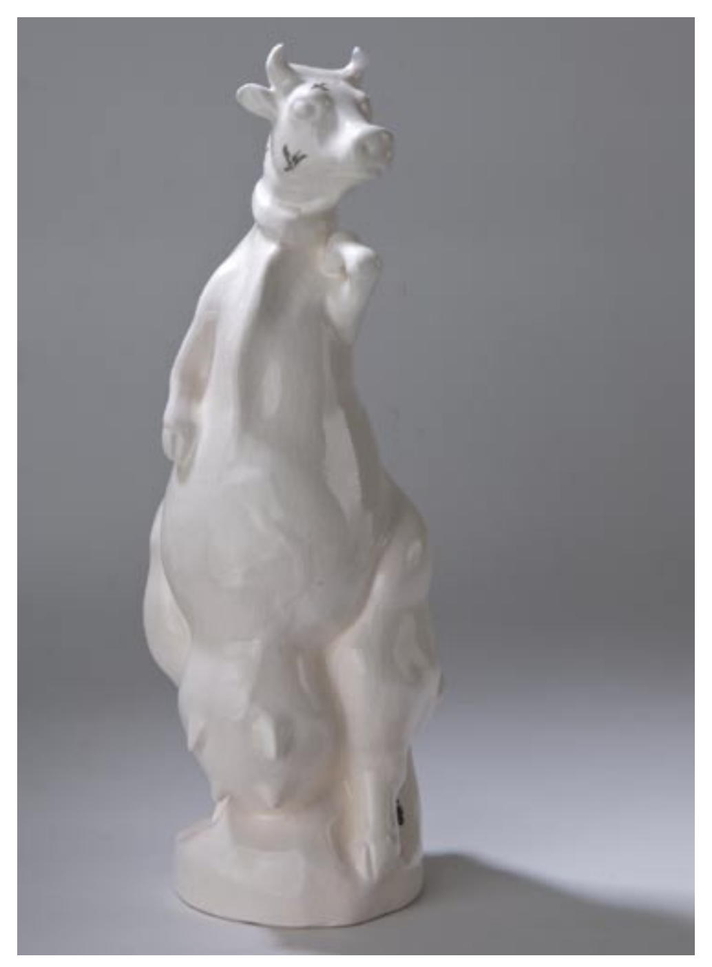
Title: COW-VID . Untitled Technique: Porcelain H 38 cm