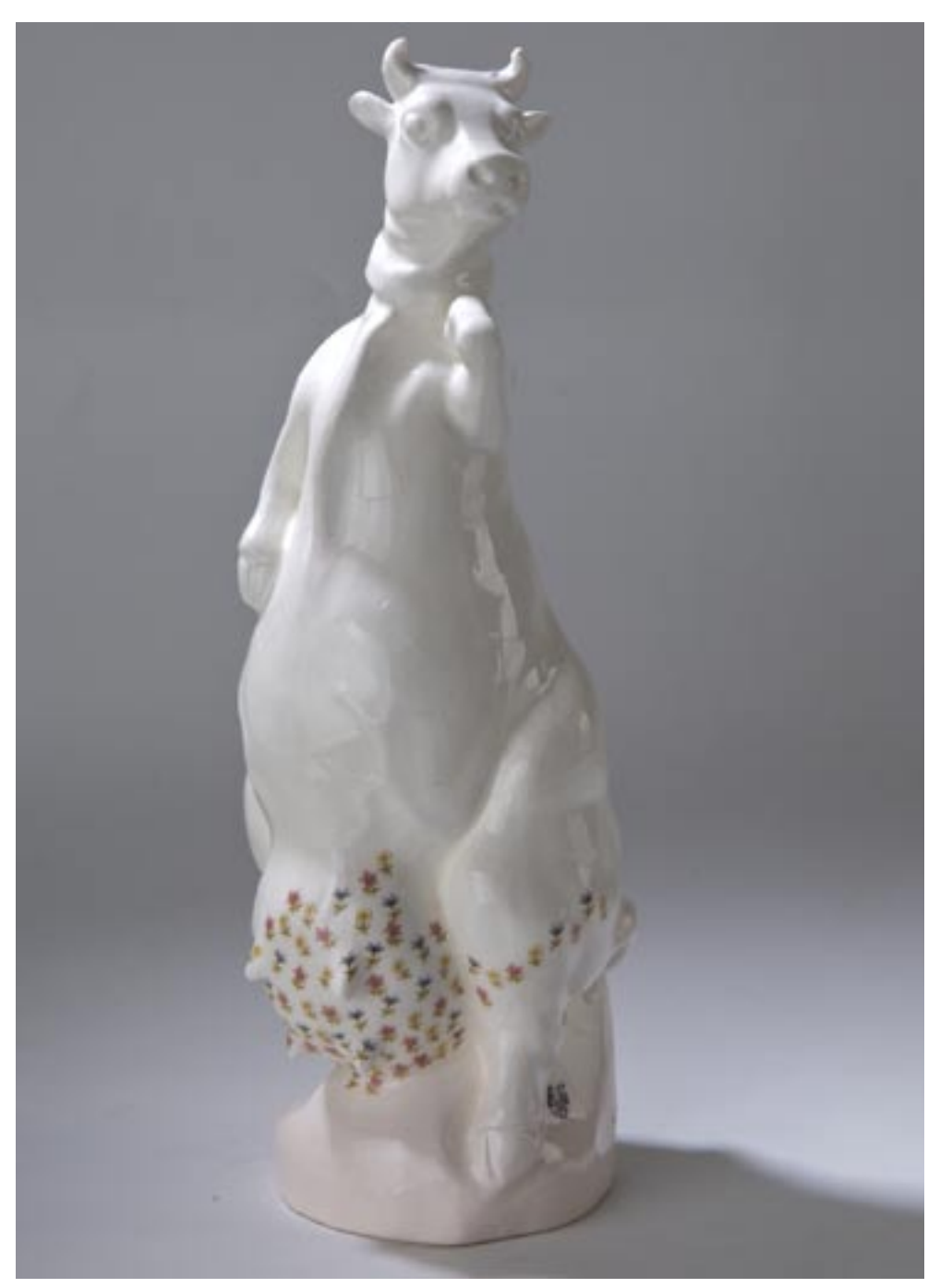
Title: COW-VID . Untitled Technique: Porcelain H 38 cm