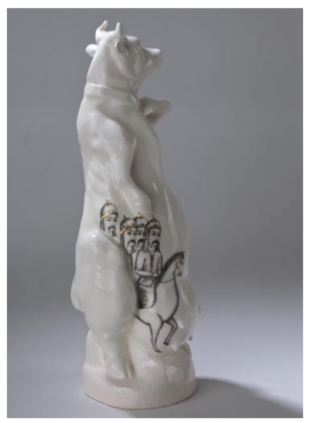
Title: COW-VID . Untitled Technique: Porcelain (Painted) H 38 cm