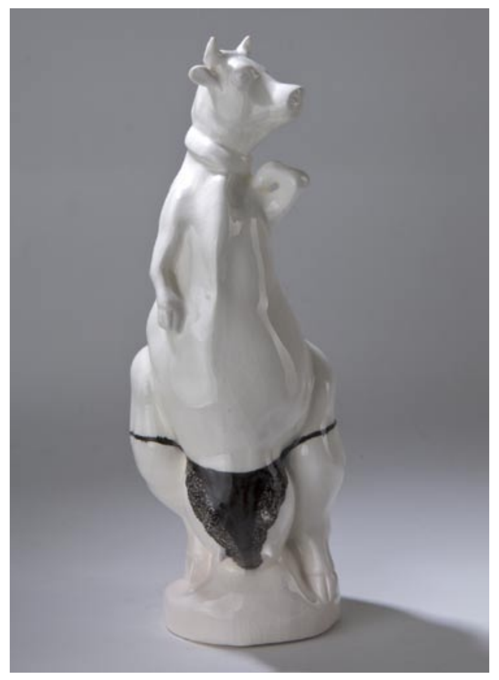
Title: COW-VID . Untitled Technique: Porcelain (Painted) H 38 cm