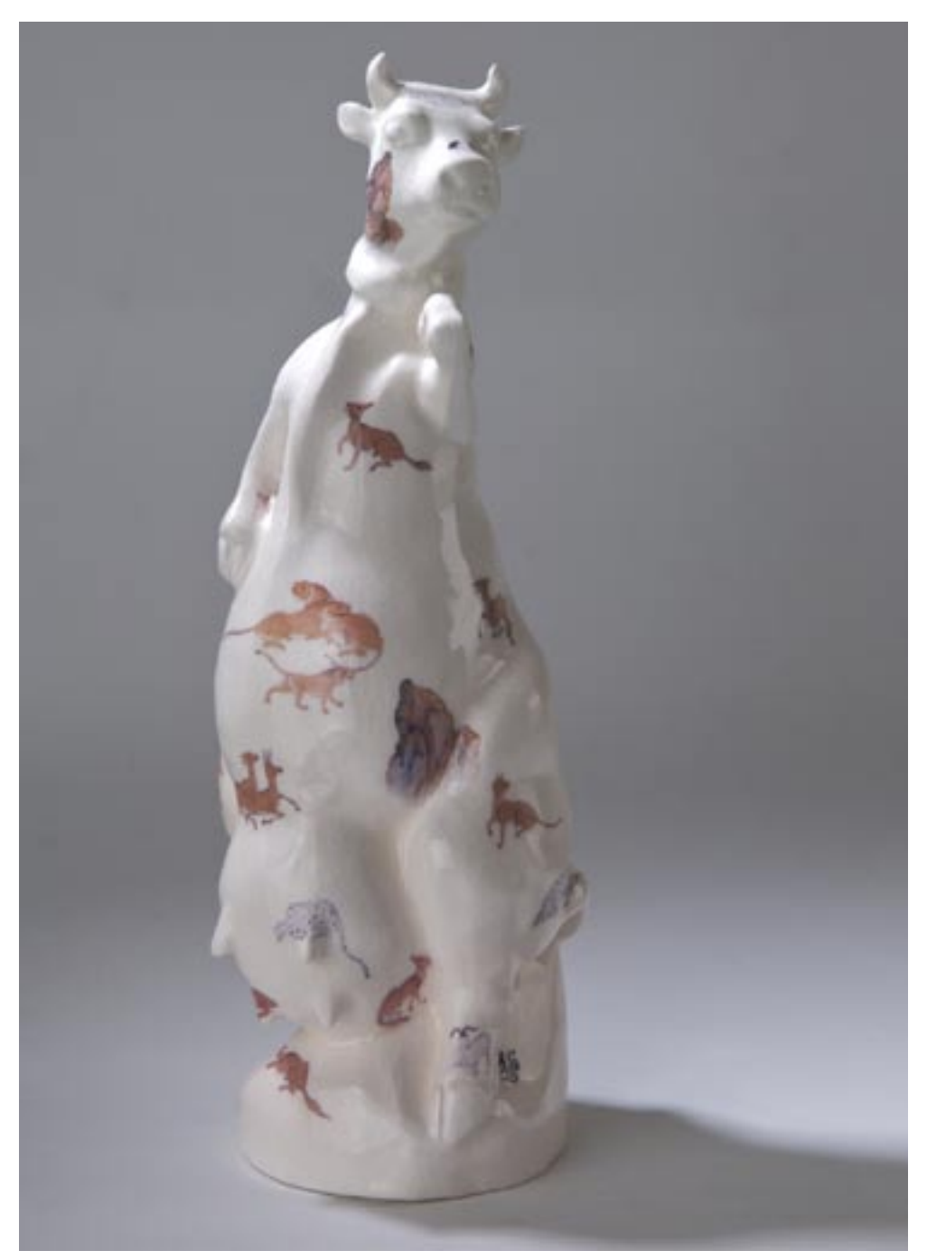
Title: COW-VID . Untitled Technique: Porcelain H 38 cm