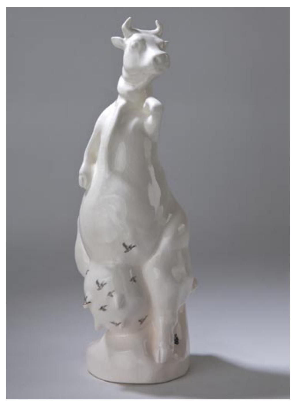
Title: COW-VID . Untitled Technique: Porcelain H 38 cm