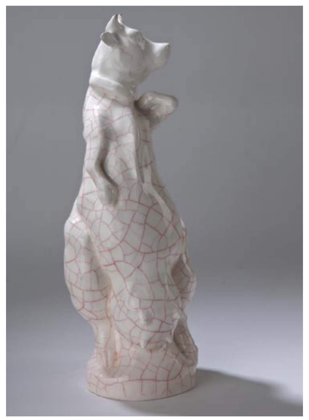
Title: COW-VID . Untitled Technique: Porcelain (Painted) H 38 cm