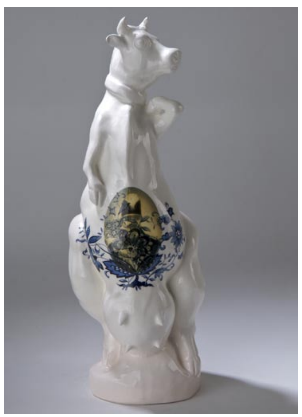
Title: COW-VID . Untitled Technique: Porcelain H 38 cm