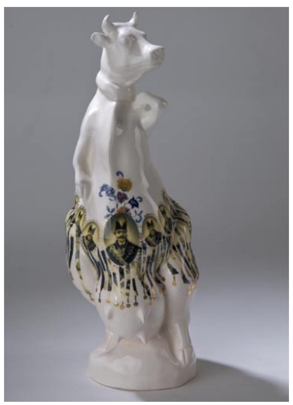
Title: COW-VID . Untitled Technique: Porcelain H 38 cm