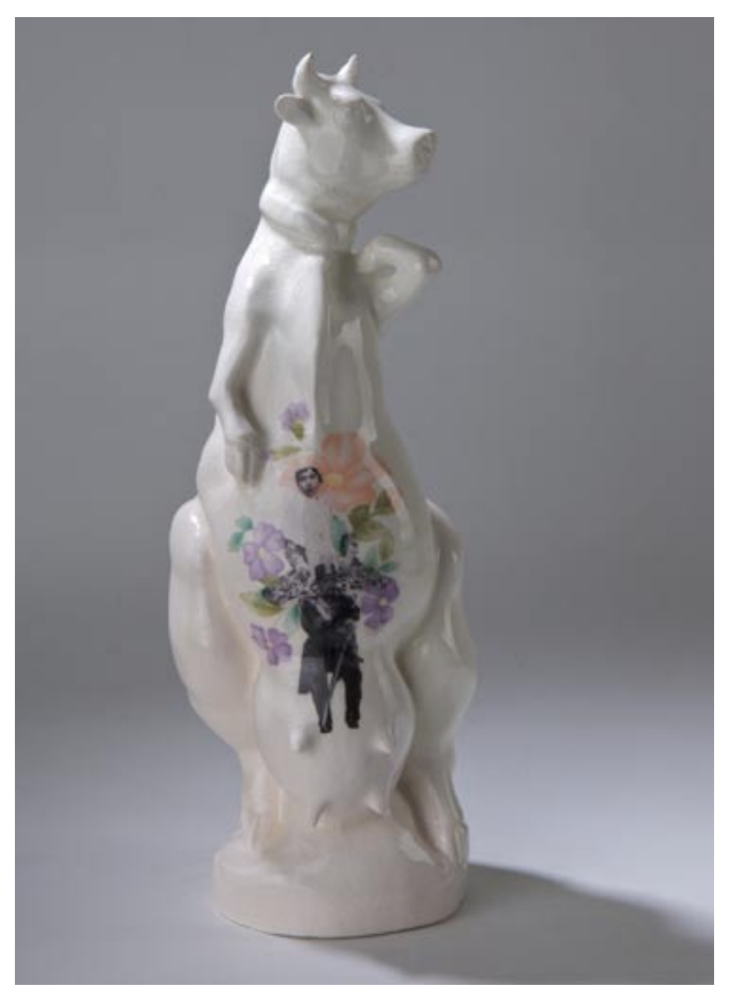
Title: COW-VID . Untitled Technique: Porcelain H 38 cm